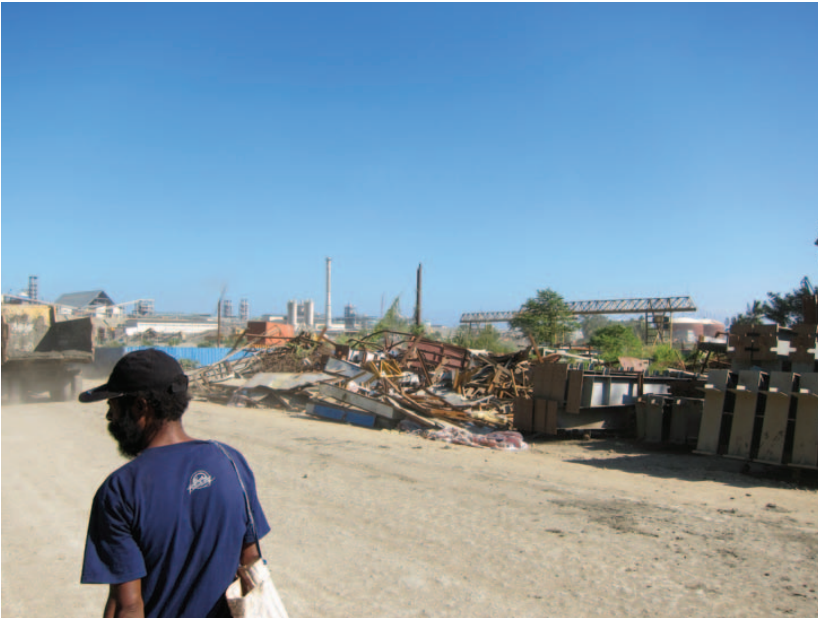
FIGURE 6. The road, dust, and debris at Basamuk, 2010.