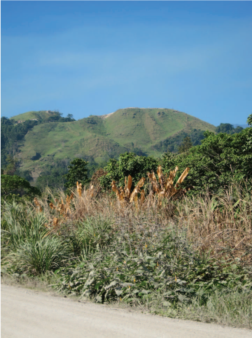
FIGURE 4. Early stages of limestone extraction in the vicinity of Basamuk Bay, July 2010.

Guinea, Sir Michael Somare, negotiated an agreement with the Chinese government-owned Metallurgic Corporation of China (MCC), currently 85% stakeholders in the resultant Ramu Nickel-Cobalt Project. Other