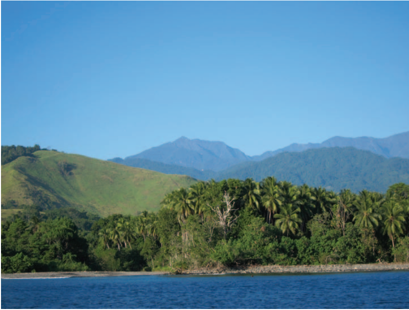
FIGURE 3. The Rai Coast's steep and dramatic limestone landscape.

The substrate of limestone has two qualities each with very different (now political and legal) implications. It is recognized as a fragile and rare landscape and is, thus, protected under Papua New Guinean environmental law (Environment Act, No. 64, 2000). However, it is also suitable as a raw material in the processing of minerals in industrial mining (Fig 4.). Limestone has a high pH value, and is thus used to balance the acidity level of waste material generated in refining processes that are then discharged from the plant. A major factor in the location of the new mine processing facility at Basamuk Bay, 20 km to the west of Reite, is the existence of this limestone. Surveys have been undertaken for at least the last decade testing the quality and depth of the limestone all along the coast. Little bore-holes appeared near the head of the road to Reite, for example, about ten years ago, where samples had been taken of what turned out to be high grade material. It is possible that compulsory acquisition would be applied to these limestone deposits should there be outright resistance to its use by Rai Coast landowners.