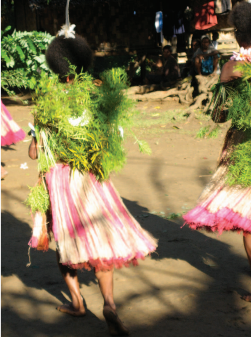
FIGURE 7. Reite bark-fibre skirts, 2006.

there, as do spirit songs ( kaapu ) or specific taro varieties; like people themselves in fact, whose distinctiveness and visibility is made through their constitution in relation to taro, spirit, landform, and myth. In this way, design and place are mutually constitutive, adding naie skirts to the other