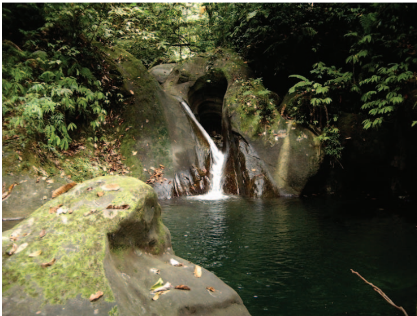
FIGURE 1. Sacred pool on the Kwang River, Sarangama.