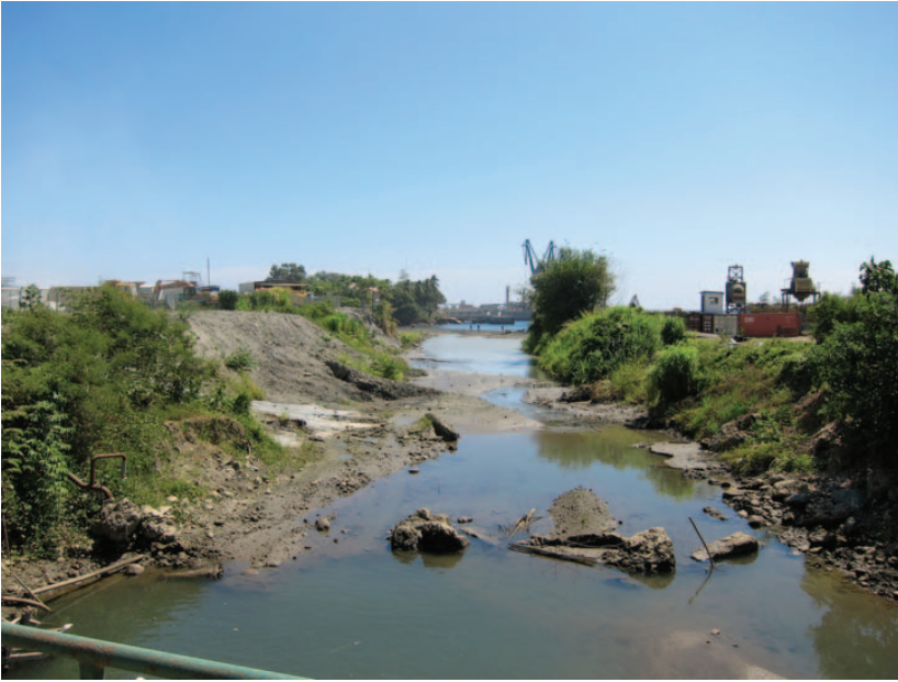
FIGURE 5. “What did we go and see?”